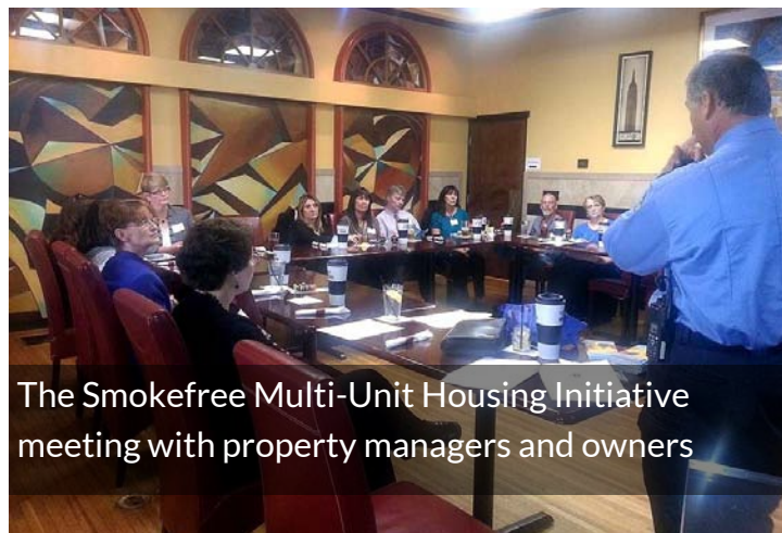
The Smokefree Multi-Unit Housing Initiative meeting with property managers and owners