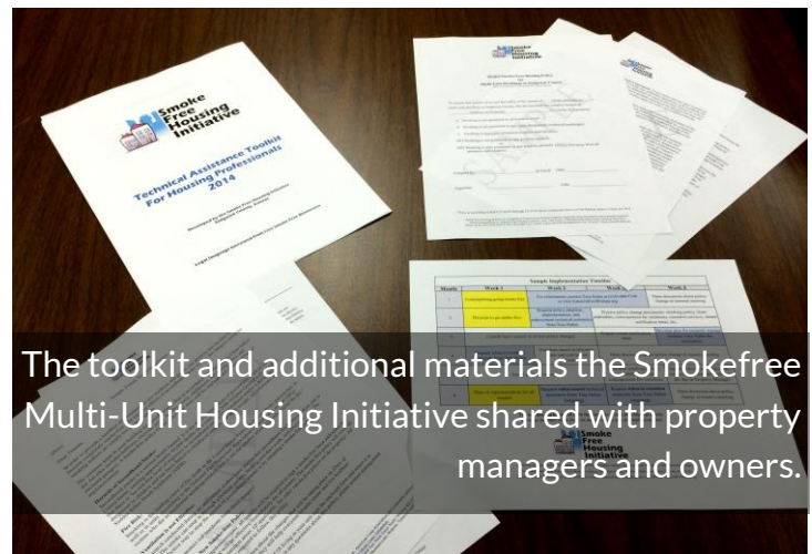
The toolkit and additional materials the Smokefree Multi-Unit Housing Initiative shared with property managers and owners.

The next session focused on logistics, the Smokefree Multi-Unit Housing Initiative presented a toolkit that included sample leases and a six-month implementation timeline. The toolkit was inspired by the American Lung Association Smokefree Housing toolkit.